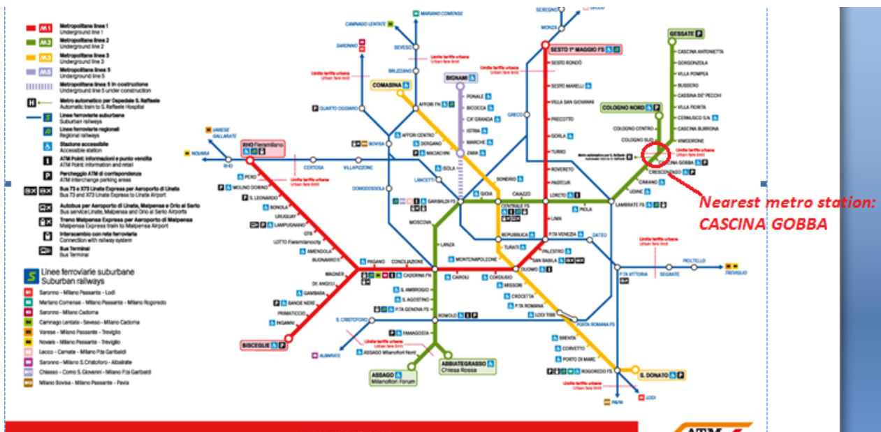
MILAN metro map:

Download PDF file from the following web link: