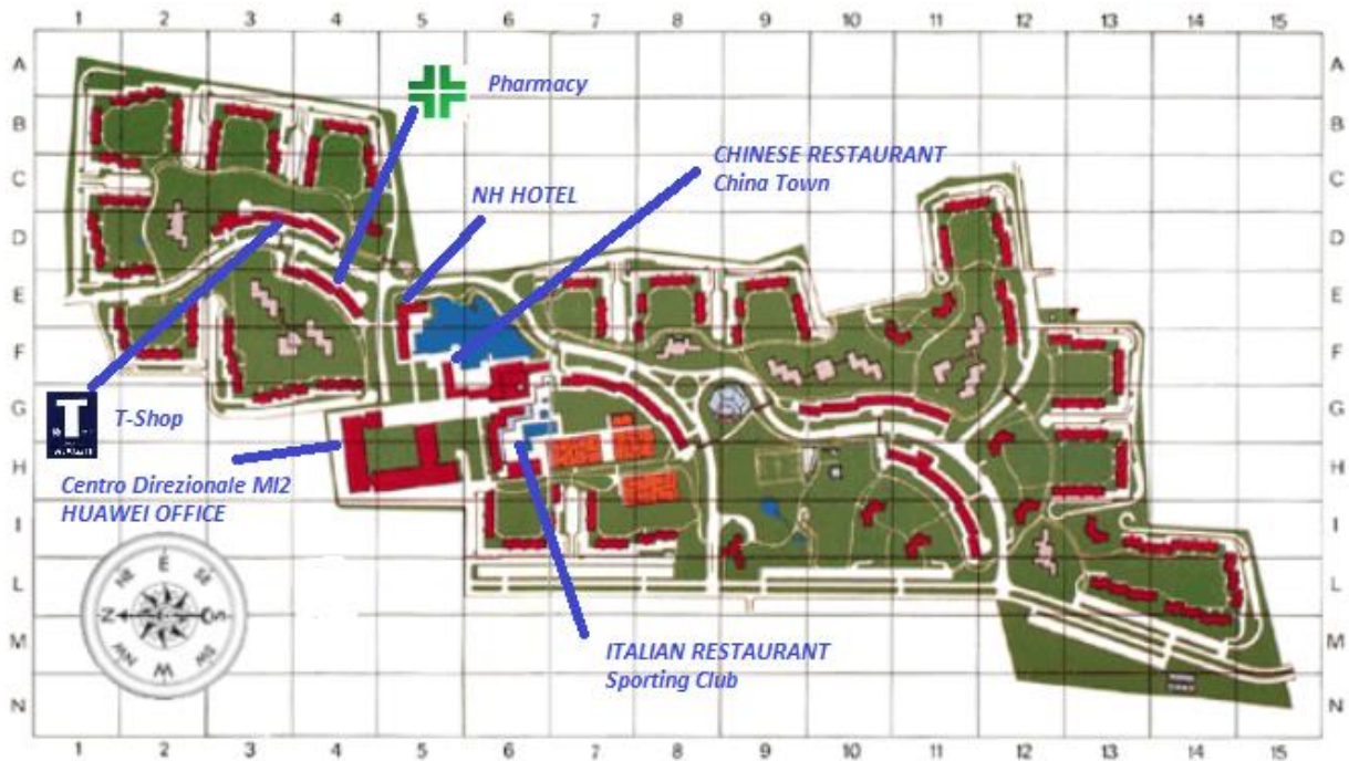
Milano2 Area – map