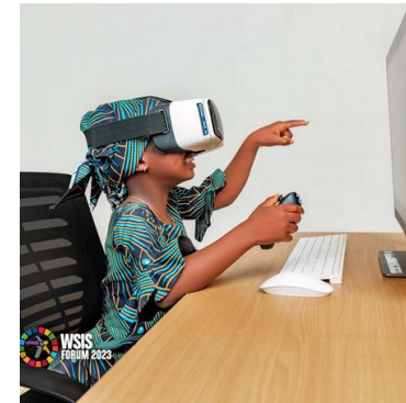
WSIS Photo Contest 2024