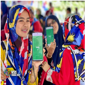
Open Consultation Process