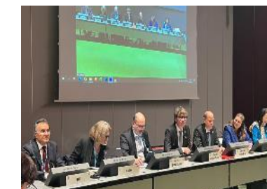
PS, CS and Technical Community Engagements