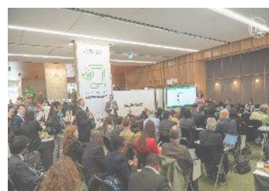
WSIS Action Lines sessions