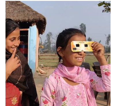
WSIS Fund in Trust 2024