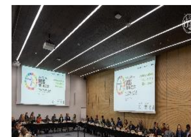
Ambassadors and Mayors Roundtable