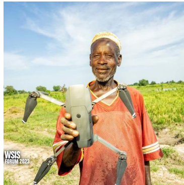
WSIS Prizes 2024