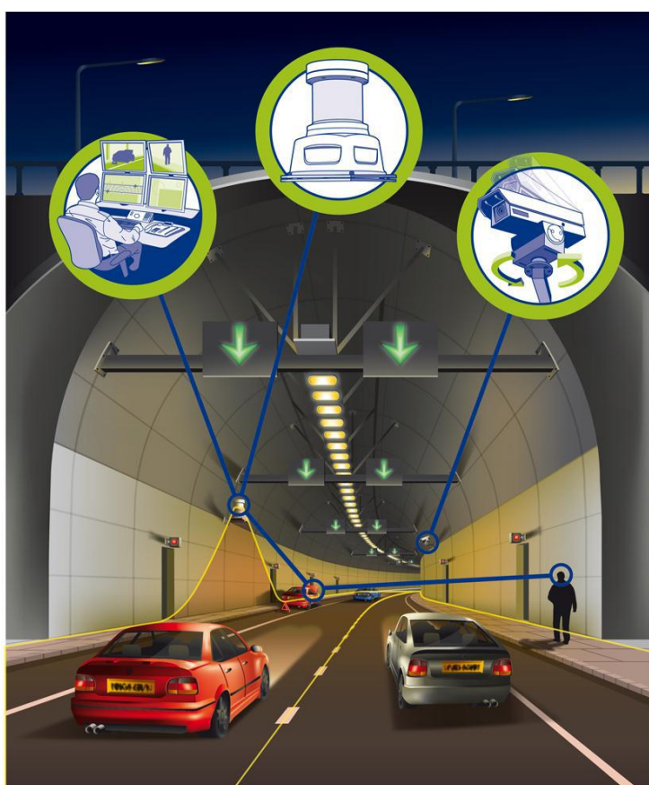
Figure 2 Incident detection within a tunnel environment

Within a tunnel environment, it is often the line of sight that limits the maximum detector range. To gain the best coverage, wherever possible, the radar should be placed towards the outside edge of any curve in the tunnel wall. From this position the radar will “see” further around the tunnel curvature. During a site survey, radar locations are designed, to ensure around curves and give overlapping coverage between adjacent sensors. The survey also takes into account changes in the tunnel bore elevation, with radar usually being mounted such that they are parallel to the road surface.